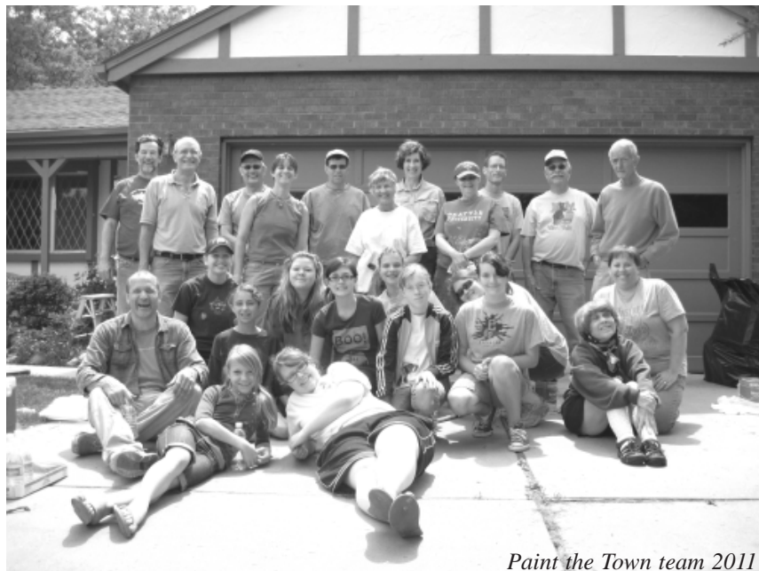
Paint the Town team 2011

Do you have memories to share? A cause to promote? A discussion you want to start? Curious what we're up to? Give us a try. Let us hear from you.